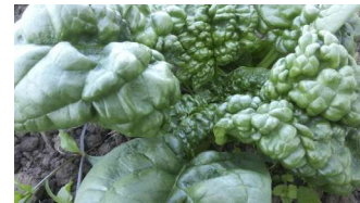
Merlo Nero spinach

SHELBY (F1, OG) ★ #2926 This babyleaf variety has attractive oval leaves and pleasing medium-green color. Shelby handles transitional weather well, maintaining its appearance and quality when temperatures are variable in late spring and fall. It also has excellent resistance to downy mildew, races 1-13 and 15. 40 days.