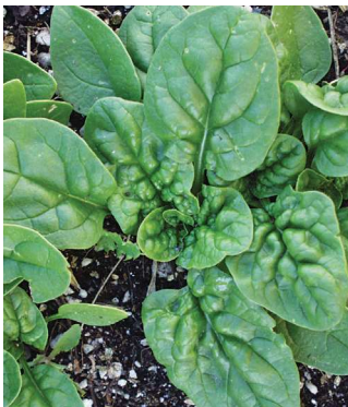
Bloomsdale Long Standing spinach

BLOOMSDALE LONG STANDING (OG, H) #2921 An old-fashioned, very reliable form of spinach, so-named because the 3-6" leaves stand up (and are ready to pick) long before the plant goes to seed. Bloomsdale Long Standing has heavily savoyed, dark green leaves which are known for their high quality. Best for spring and fall growing. Approx. 2,000 seeds/oz. 39 days.